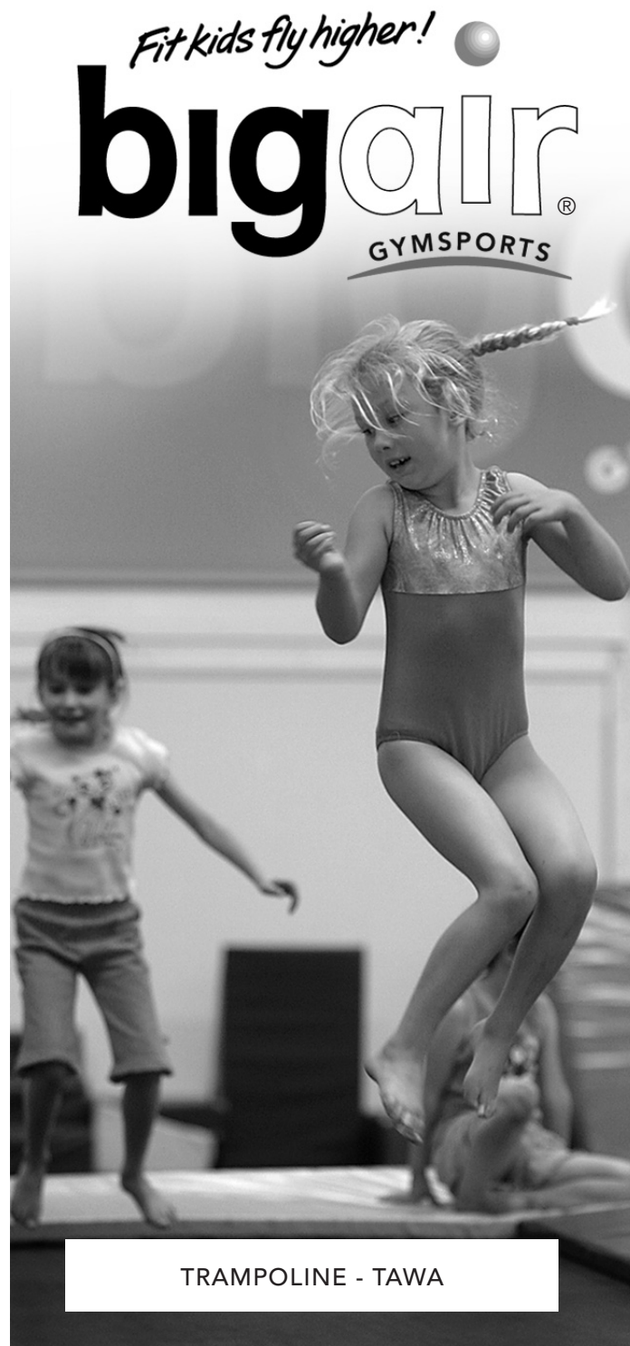
TRAMPOLINE - TAWA